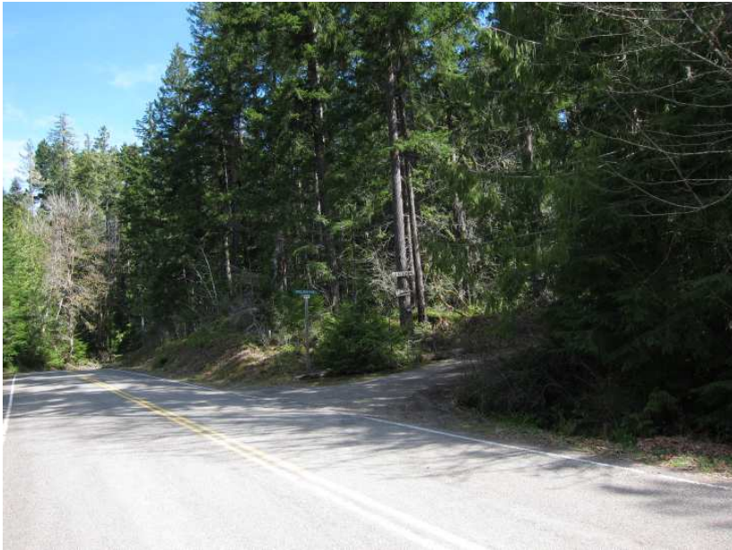
Right on Poulsen Point Road