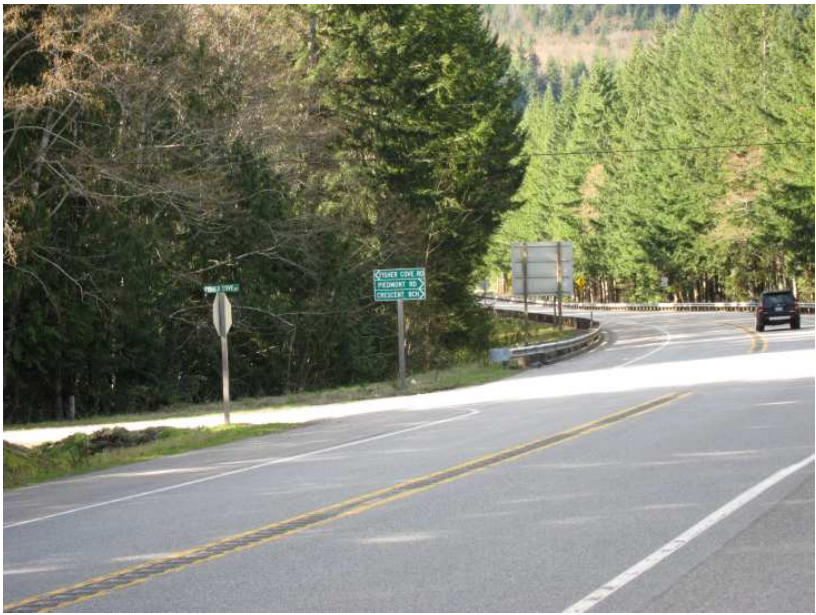
Left on Fisher Cove Road